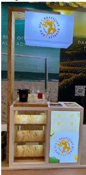
Image as reference for the wineries' counters.