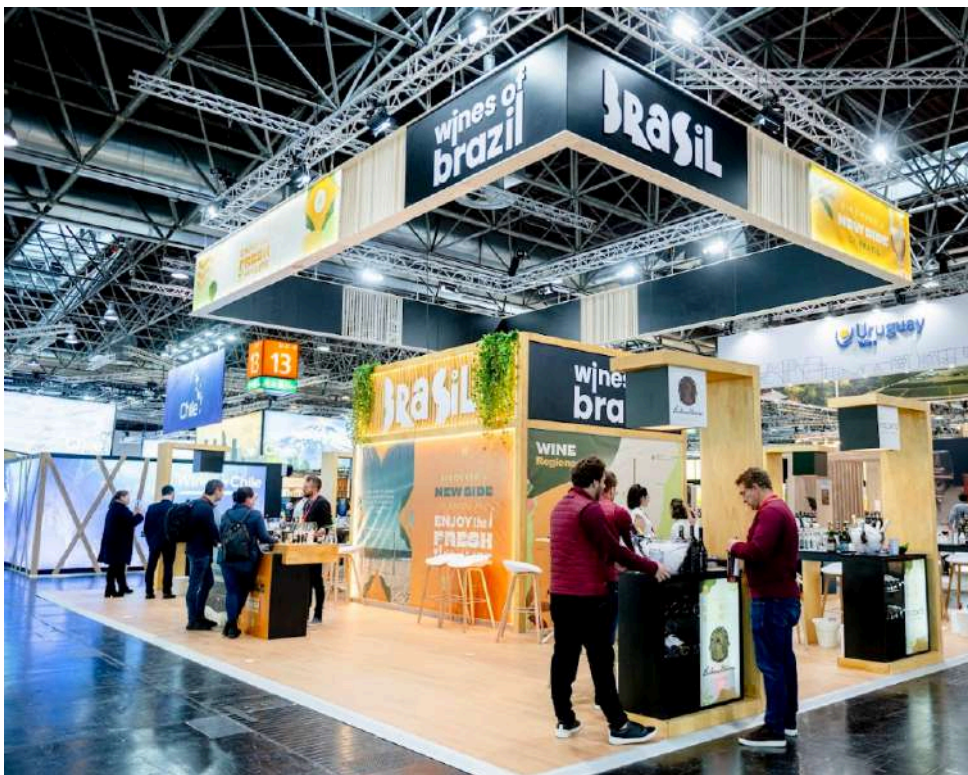
Wines of Brazil stand at ProWein 2024

See below an image to exemplify the hanging sign of our stand at the ProWein 2024 (1) and images from other countries (2), which we based this design on.